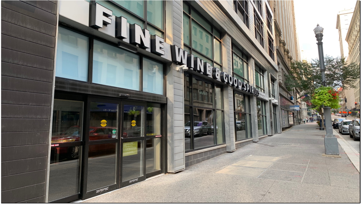
Today the Wine and Spirits shop is where the theater once stood.