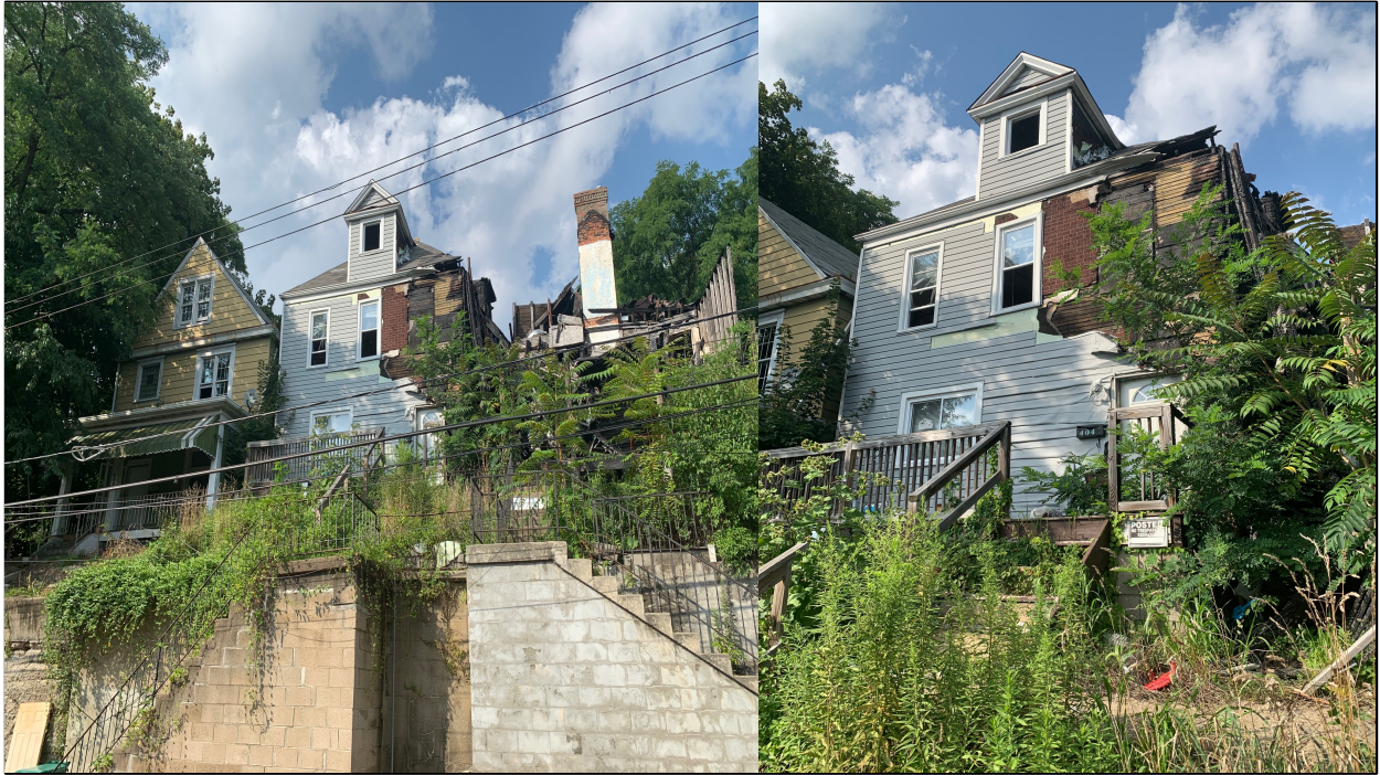
404 Woodward Ave, McKeesrocks, PA. This was Krug's parents house where the couple lived for the first six months. They moved into an apartment in the Flats of McKees Rocks afterwards but I cannot locate the address at this time.