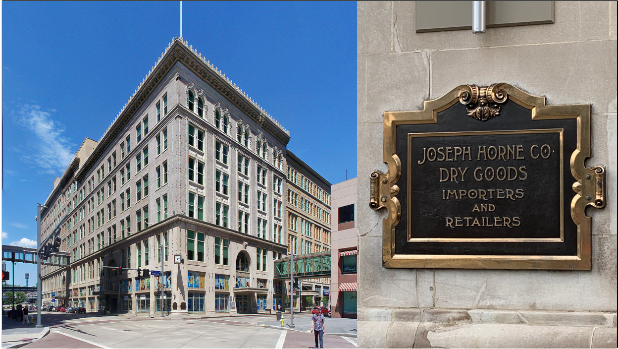
Olive worked here as a wrapping girl. The photo on the left is from Wiki-Commons. The one on the right is my photo.