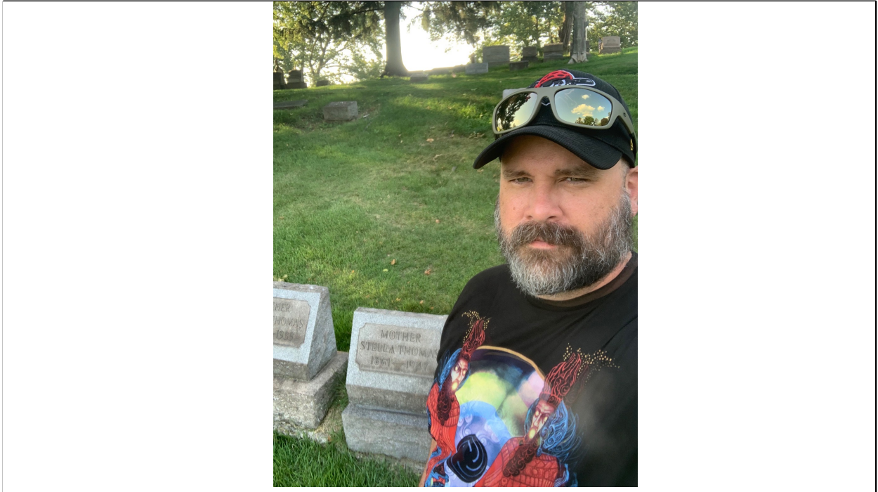
Me in 2021 at the gravesite.